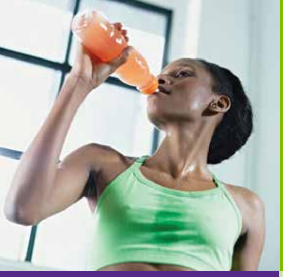
Milne products deliver the fresh taste preferred by today's health-conscious consumers.