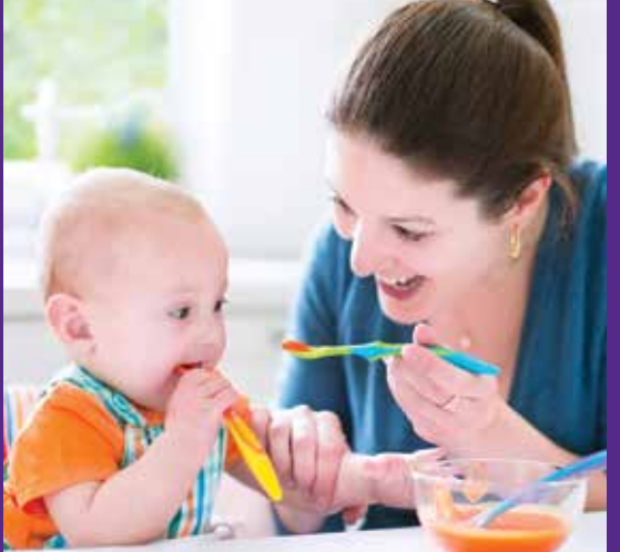
Milne continues to produce quality juices and purees while providing custom blending, compounding and formulation services to create better consumer beverages and products.