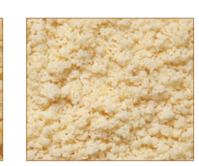
Diced Small 12/8