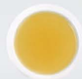
Yuzu Luxe Sour

Don't see what you're looking for? Contact us for our custom flavor abilities or offerings