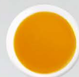
Mango Passion Fruit