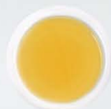
Thai Basil & Black Pepper